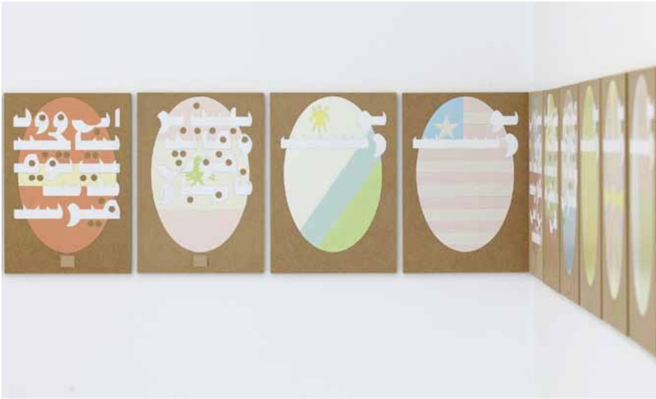
Responses to an immigration request from one hundred and ninety four governments , 2006-2009 (DETAIL), Oil and gesso on MDF, Installation, Sutton Gallery in 2009, 194 panels, 30x21cm each - Courtesy of the artist and Sutton Gallery, Melbourne – Australia.