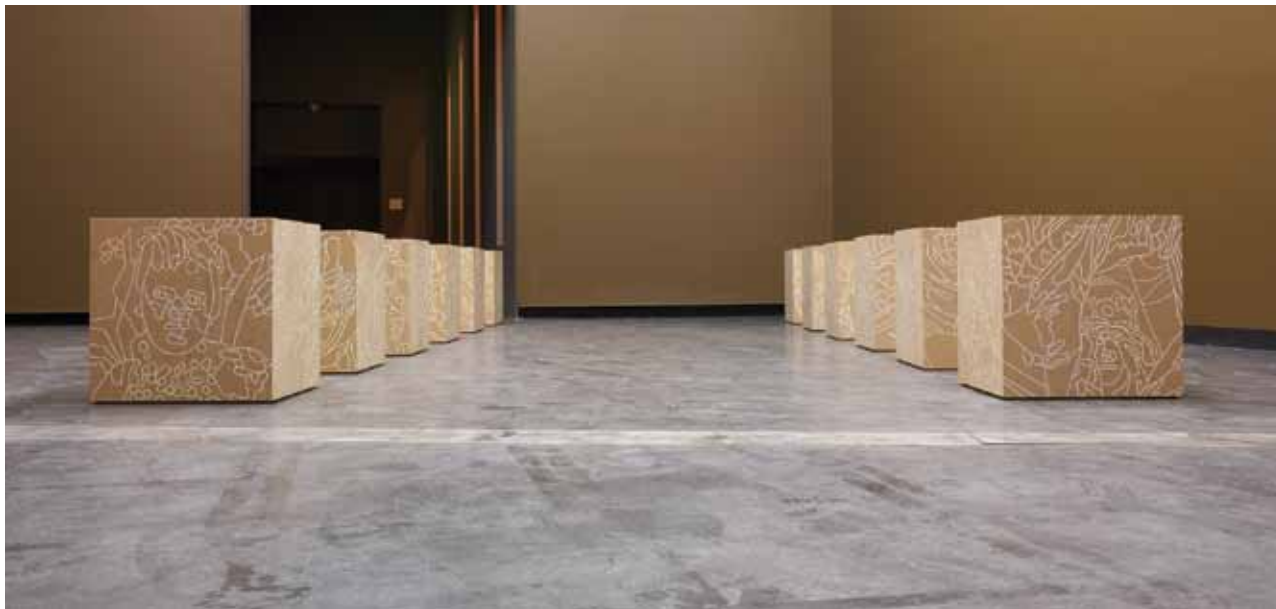
Avenue of Superfluous Complaints , 2010, Synthetic Polymer on MDF, Installation, NEW010, Australian Centre for Contemporary Art, 12 parts, each 50x50cm each - Courtesy of the artist and Sutton Gallery, Melbourne

Raafat Ishak's Responses to an immigration request from one hundred and ninety four governments , 2009, stems from a project that began in 2006, when the artist sent a standardised letter to all existing governments requesting citizenship (aside from his birthplace, Egypt, and residence, Australia) and he received ninety seven replies. The result of this project is an exhibition of one hundred and ninety four paintings, each depicting a country's flag in a mutation of its true colour, juxtaposed with an abbreviated Arabic transcript of that government's response to Ishak's request for citizenship.