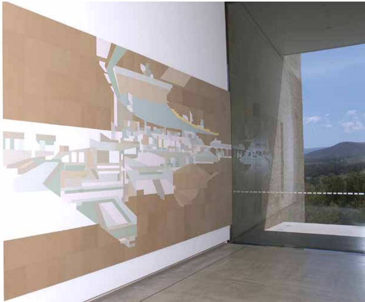
Mount Rupture on the verge of a conclusive appearance , 2006, Acrylic on MDF, 210 Panels, 27x27cm each (Overall 270x567cm),- Courtesy of the artist and Sutton Gallery, Melbourne – Australia.

paint is matched to zoning colours of urban planning charts: the figures' outlines coalesce and can be read as topographical charts, "Ishak's crowd is a map of collective behaviour; as a map is an ideal representation of territory." 4 Carefully manipulating the space, Ishak's cubes were positioned in pairs at equal intervals, creating a corridor that mimics Australia's Avenues of Honour (tree-lined streets at the entrance to regional towns, each tree planted for a soldier who had enlisted and was a resident of the locale). With this grand entrance and exit, Ishak pays homage to a cultural pride of place.