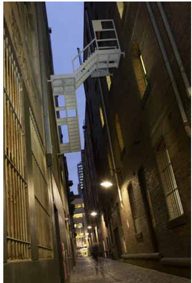
Organization for Future Good Steps , 2008, City of Melbourne Laneway Commission

With deft precision, Ishak paints onto panels of MDF, a type of particle board commonly used to fabricate the framework for buildings. On these raw, flat surfaces, he merges architectural spaces, demonstrated in his large-scale installation Mount Rupture exhibited at the 2006 TarraWarra Biennial. The undulations of the TarraWarra valley are morphed into the modernist architecture of a grand stadium. Mount Rupture is an invented mountain. For Ishak, this mountain is a device to reference the actions of ascent and descent, a notion further articulated in his integration of sports stadia